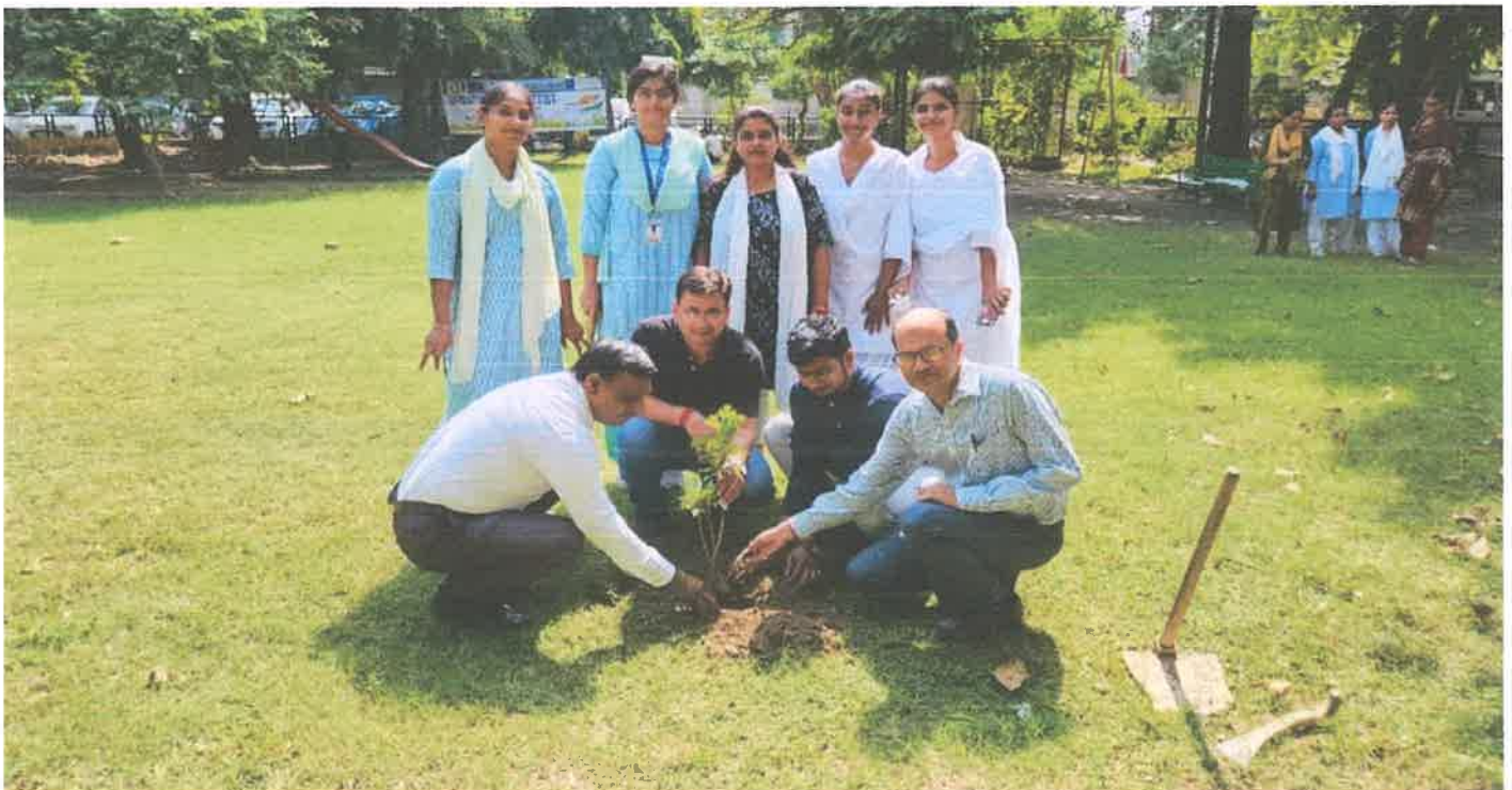
Plantation Drive outside the campus

Principal SRI KRISHNA DUTT ACADEMY 2D/HS-1, Vrindavan Yojana Raibareilly Road, Lucknow