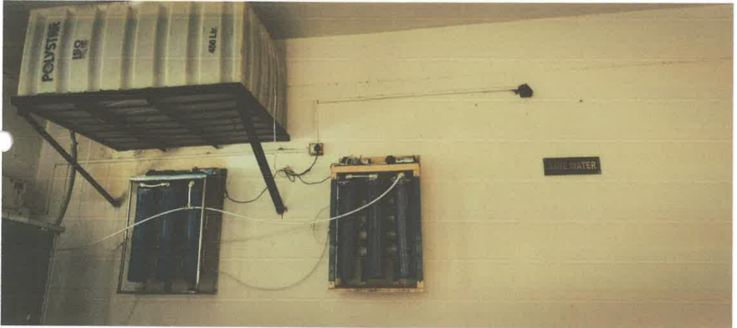
RO System installed in campus

2D/HS-1, Vrindavan Yojna, Raibareilly Road, Lucknow, Ph. : 2443963, 7080111596